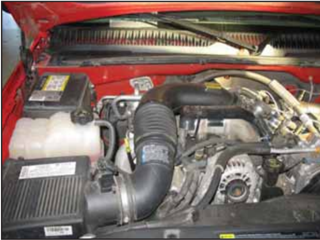
a. Factory air box system installed.