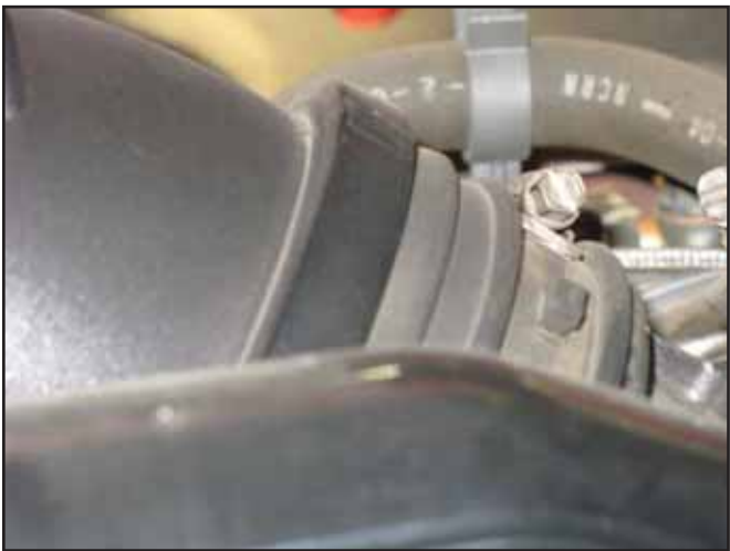
c. Lift up on the intake resonator to pop it off the mount and gain access to the hose clamp on the inlet tube. Loosen the hose clamps on both ends of the inlet tube.