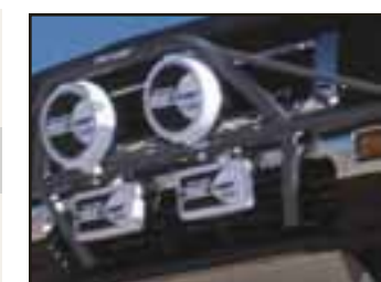
Stylish and functional bolt-on auxiliary light bar. P/N 17000. See pages 100-101 more details.