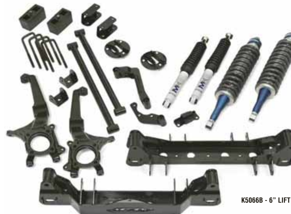
K5066B - 6" LIFT