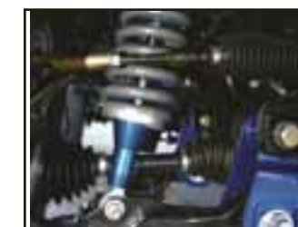
The heart of our premium Tacoma kit is the custom tuned Xtreme 2.75 C coil over shock system.