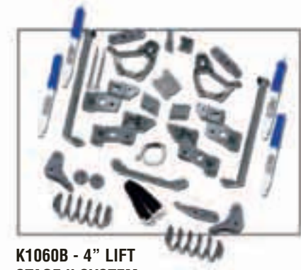
K1060B - 4" LIFT STAGE II SYSTEM

Our Stage II systems add supported lower control arm drop brackets to eliminate lateral flex and cross member compression struts add a custom appearance. 90-95 4Runner achieves rear lift with 4" coils, 4-link relocation brackets and track bar relocation bracket