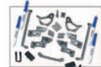
K5055B - 4" LIFT STAGE II SYSTEM