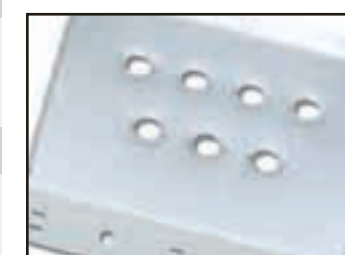
High performance stainless steel skidplate helps protect the underside of the vehicle. See skidplate page 63 for more details. Skid plate P/N 57193 for T100 only.