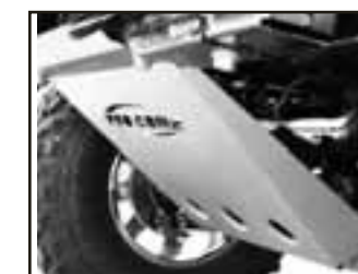
High performance stainless steel skid plate helps protect the underside of the vehicle. P/N 57196. See skidplate page 63 for more details.