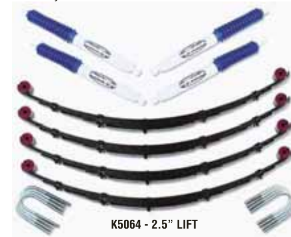
K5064 - 2.5" LIFT

We offer the necessary components to make the capable Toyota straight axle trucks even better. Pro Ride front and rear leaf springs with urethane bushings increase height and ground clearance. Box kits provide sway bar link extensions, bump stop extension, and front U-bolts and an adjustable drag link is offered for steering correction. FJ40 box kits include front and rear U-bolts only.