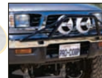
Functional bolt-on auxiliary light bar P/N 10000 for 95 - 97 / 01 - 04 Tacoma/Pre Runner. See pages 100-101 more details.