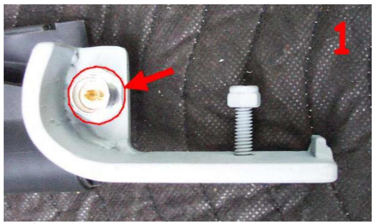
Image 1 <u>Image 2</u> shows the location of the mounting hole that is already on you FJ's Hinge. This will be where the mount bolt will go through when you place the mount in position.