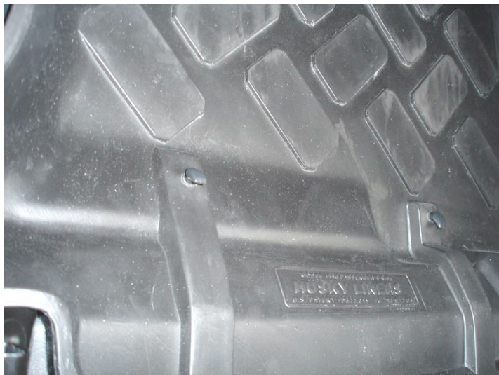
HUSKY LINER PART #3596 SHOWN INSTALLED IN THE FJ CRUISER. NOTE THAT LINERS MUST BE ATTACHED OVER FACTORY MAT HOOKS TO HELP SECURE LINERS IN POSITION.