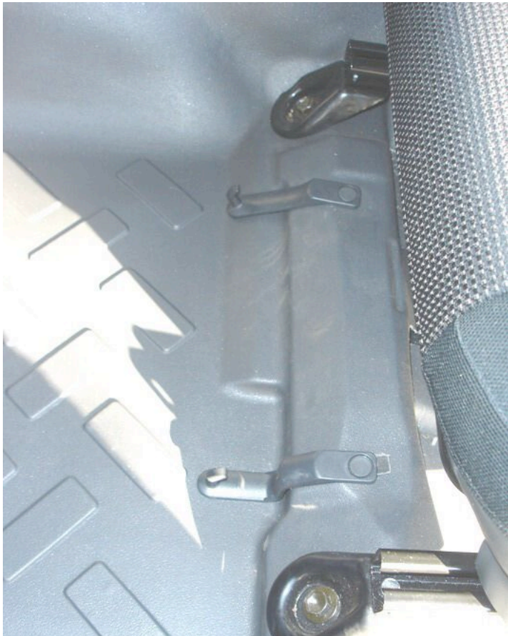
FJ CRUISER DRIVER'S SIDE FLOOR PAN WITH MAT HOOKS INSTALLED