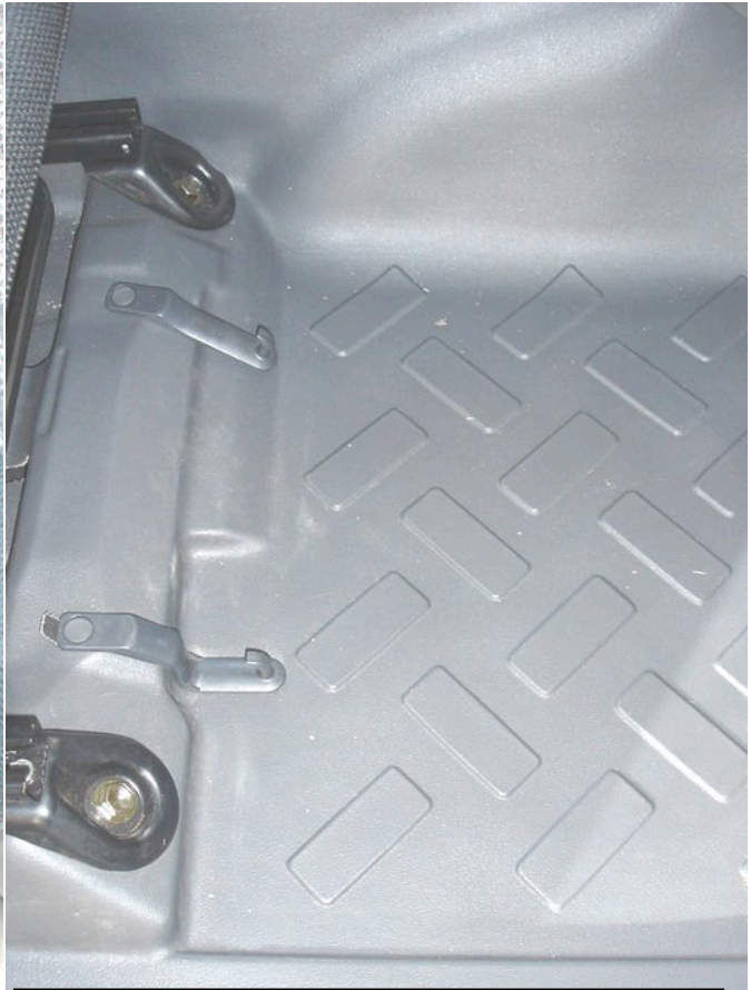
FJ CRUISER PASSENGER'S SIDE FLOOR PAN WITH MAT HOOKS INSTALLED